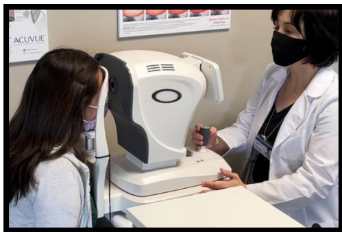
Optical assistant measuring the front curvature to ensure the best fit of contact lenses.

During this examination your eyes will be assessed and measured to see if they are suitable for contact lenses, which contact lenses will suit your eyes and how your eyes will respond to contact lens wear.