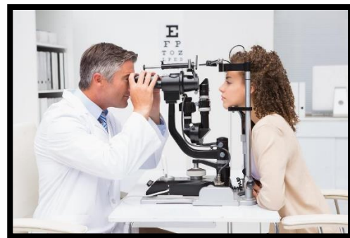
Optometrist uses a Slit-lamp to determine health of the eyes to wear contact lenses.

You must receive instructions about handling and cleaning your contact lenses. You must follow all the instructions from your optometrist on wearing, disinfecting, and disposing of lenses. You should attend all follow up visits as advised by your optometrist or if you have any discomfort or sign of infection.